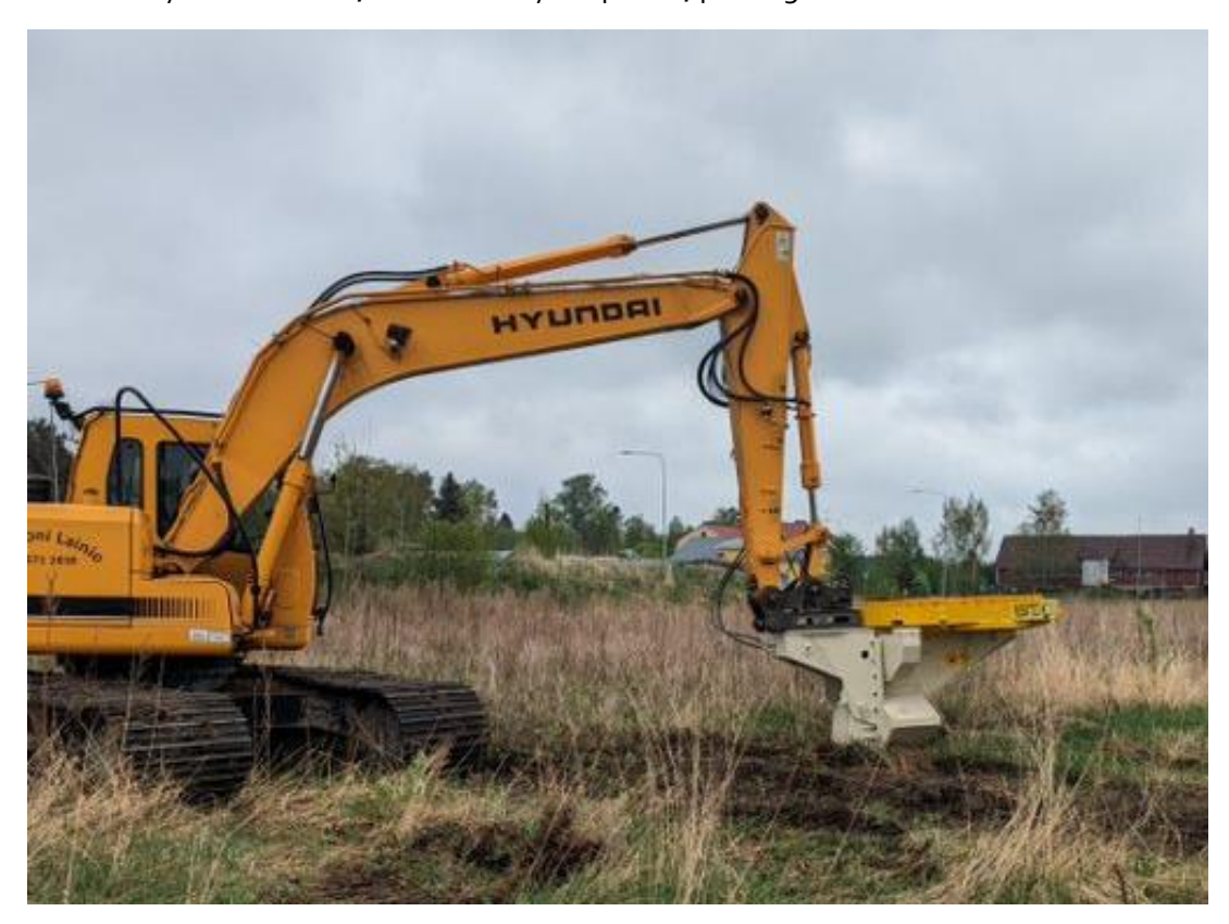
Figure 3 A Risutec SKB planter head, being prepared for delivery to Indonesia.

A key theme seen right through the supply chain was mechanisation. This is a trend seen globally, with a few key drivers. Chief among them is sheer labour shortage, from which Queensland is not immune. Alongside this is a need to increase labour productivity to remain competitive on the global stage . Mechanised timber harvesting is well and truly entrenched in Queensland, however other silvicultural operations are not. I visited 2 manufacturers of machinery to carry out spot site cultivation and tree planting in one pass. These manufacturers were increasing their deliveries globally, with South America being a key market for both of them. Units were also being delivered to Africa and South East Asia as well. We would typically consider these countries to have low labour costs, yet mechanised silviculture is still attractive. These machines are demonstrated to work in a variety of conditions, with a variety of species, proving their usefulness.