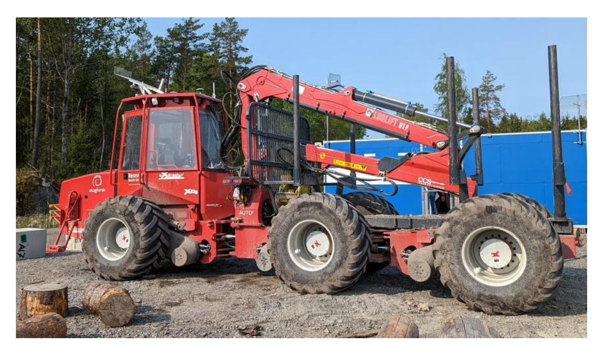
Figure 5 The remotely operable forwarder, put together by Skogforsk .