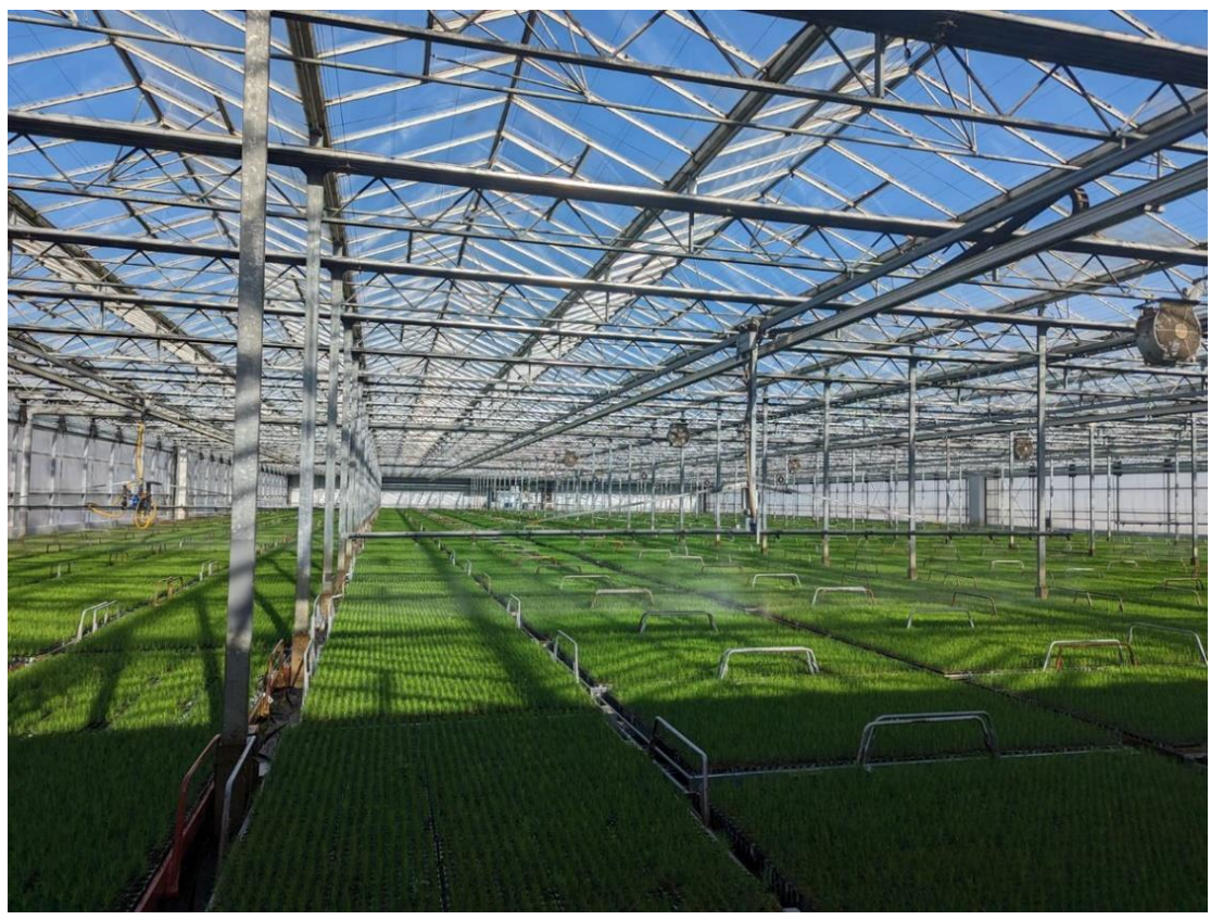
Figure 4 One of a number of greenhouses, with control, climate control and automated fertigiation

was working properly, moved trays around mechanically and ensured the greenhouses and field systems were all working.