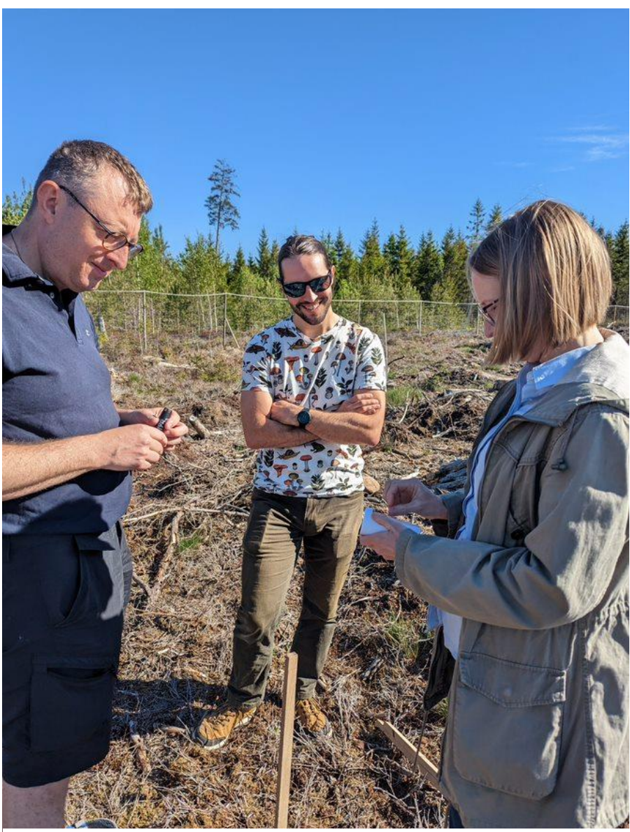
Figure 2 Forest Science being done in the field. How many Foresters does it take to hang a thermometer?

A key research project which a lot of people were very proud of was the Autoplant. This was a very large research effort proving that an autonomous machine could be built to successfully traverse an area and plant trees. The ability of the machine to navigate the area, pick a planting site, the sequence of events to plant a tree, and the logic within the robotic control program to make all of this happen was incredible to learn about.