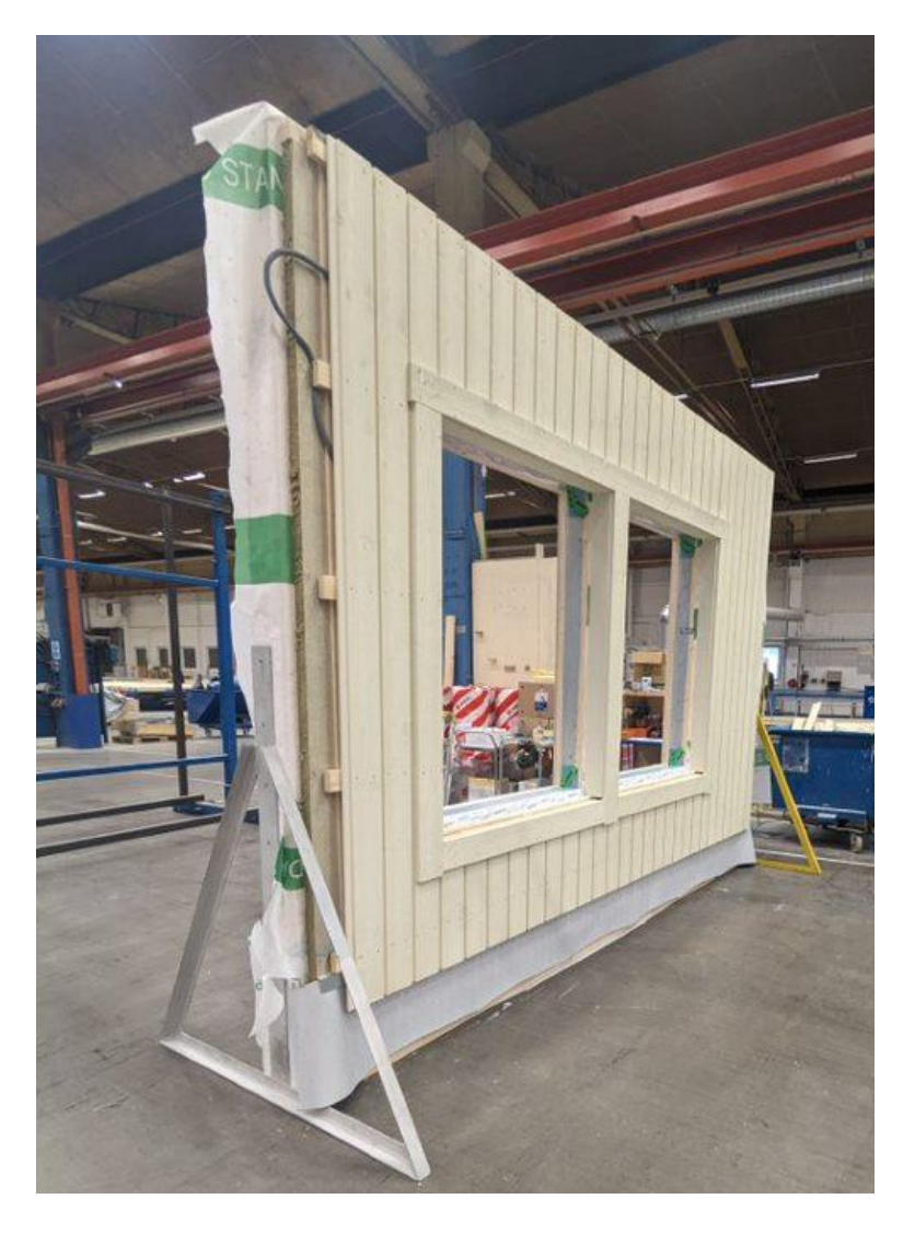
Figure 7 External wall for a module, ready for assembly. Note the thick insulation and double glazing on the windows.

In a country with a climate that makes building challenging for half of the year, this pre-fabricated system allowed for year round work in a warm factory, and greatly reduced time on site , typically less than 12 months from turning a sod, to residents moving into a large apartment