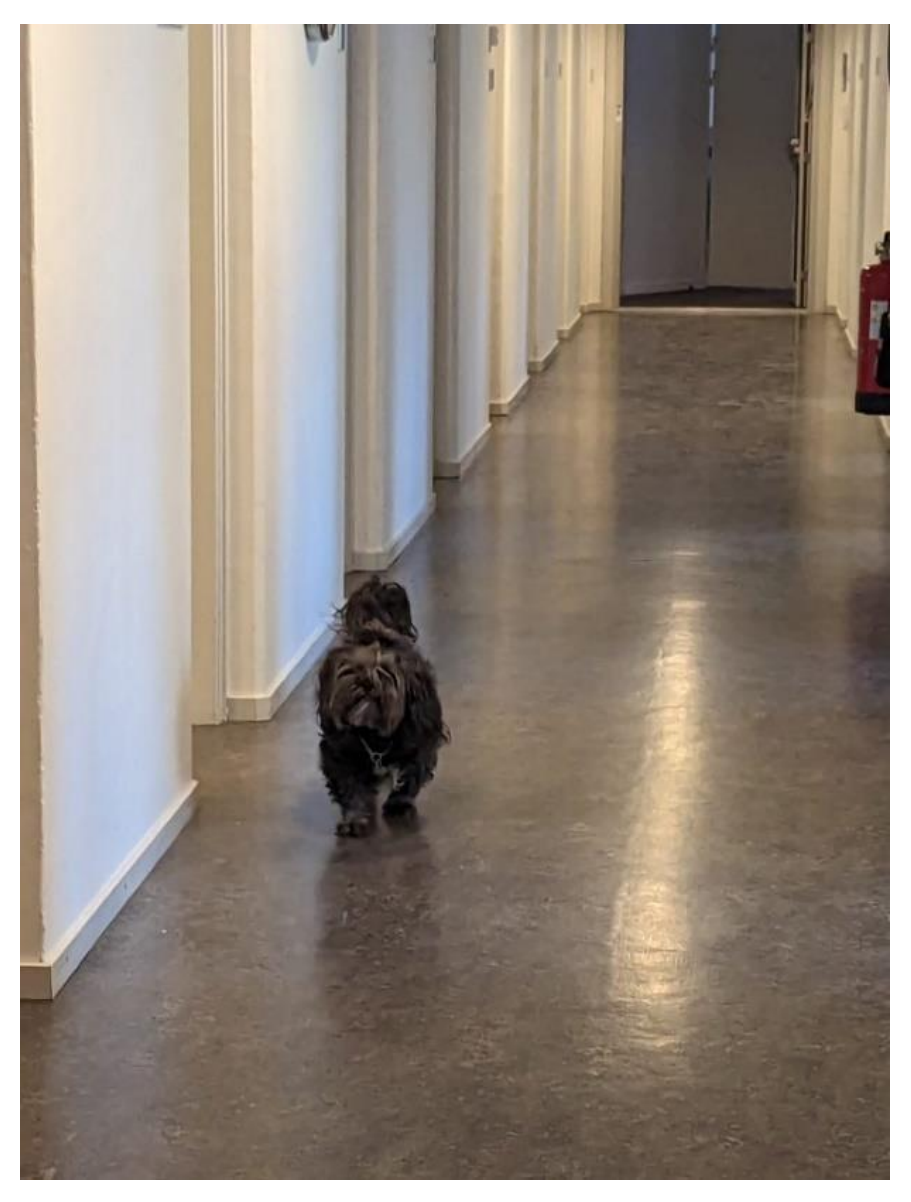
Figure 8 This was the Vida Building guard dog. A very important staff member