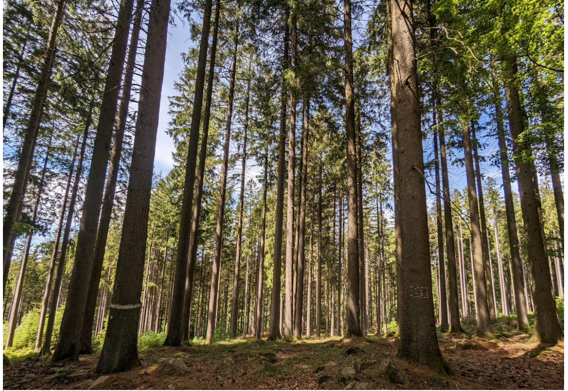
Figure 1 This is a thinning trial planted in 1875, and monitored from the 1920's in Tönnersjöheden. Every Forester trained in Sweden visits this site.

These two countries combined make up about half the area of Queensland, and have a total population of around 15 million. The Forests and Timber industry makes up around 10% of Sweden's total economic output, and a touch more than this in Finland. There is a long history of forest use by the inhabitants of the area, relying on a healthy forest not only for building materials but also food, game, and recreation. The volume of their annual harvest is orders of magnitude larger than Queensland's, however their processing technology multiplies the value of their timber assets. Because forests and timber are so important to these countries, their research capacities are very significant. In summary, the Forests and Timber industry is critical to these countries economically but also culturally.